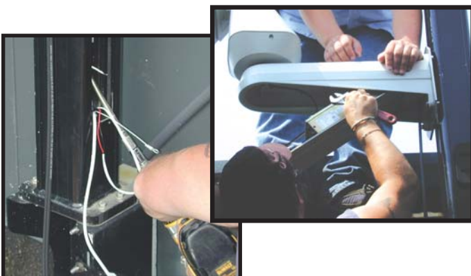
Servicing is quick and easy. The camera is lowered to the roof level with a drill. No bucket trucks or long ladders precariously placed high in the sky.

A total of four PolEvatots are at the stadium, one each on the end zone scoreboards, one on top of the luxury boxes, and one on top of the press box. The cameras are used for monitoring of the stadium and surrounding areas during games, and are also used to monitor the traffic patterns and the campus itself at all times. Monitoring is done at PSU Police headquarters.