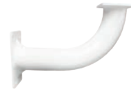
W-MNT12 Wall Mount for NiteTrac Series